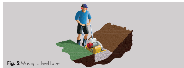
Fig. 2 Making a level base

Compact the soil in the base of your trench. Then add compactable base course (fine gravel) to the trench and compact until firm and level (for Firth Ezi Wall® / Sedona Stone® /Garden Wall®) to a depth of 150mm. For Country Manor a depth of 200mm is required. Check this both ways with a level and stringline to make sure your wall will be built on a good foundation (see Fig.2).