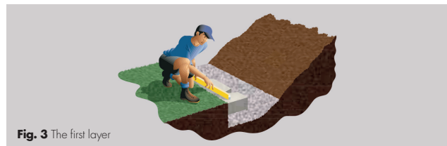
Fig. 3 The first layer

Getting the first layer perfectly level is critical to the accuracy of your wall. For Sedona and Garden Wall, chisel the locator lips off the blocks for the first layer prior to laying. Place the first layer of blocks on the prepared base, making sure that each block is in full contact with the base course and level from side to side and front to back. Stringline the back of the first layer to verify straightness. On sloping sites always start from the lowest point and work upwards (see Fig.3).