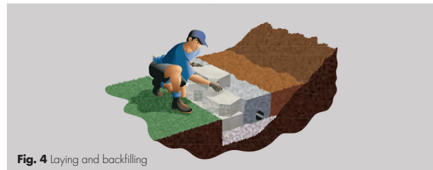
Fig. 4 Laying and backfilling

If the wall is going to be over 3 layers, place a drainage coil (65 or 100mm diameter) behind the first "above ground" layer of the wall. Extend the coil away from the wall to ensure good drainage. Connect the coil to the nearest silt trap.