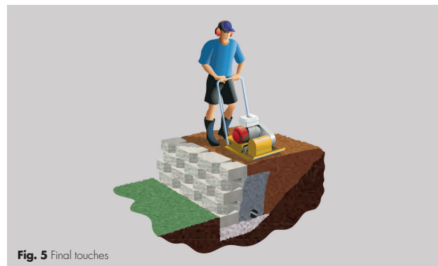
Fig. 5 Final touches

As each layer is finished, backfill with free drainage aggregate extending out 150mm for Eziwall/Sedona Stone and Garden Wall. 300mm for Country Manor and compact. Do not use topsoil or clay material as backfill. As you build your wall, fill the cavity behind it. Ensure all cavities within each unit and gaps between are filled with free drainage aggregate. Backfilling and compaction should be carried out in 150mm to 200mm layers (see Fig.4).